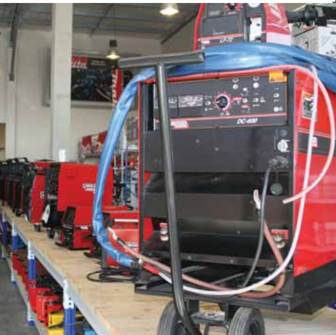
The Lincoln Electric display of products at Cosmo.