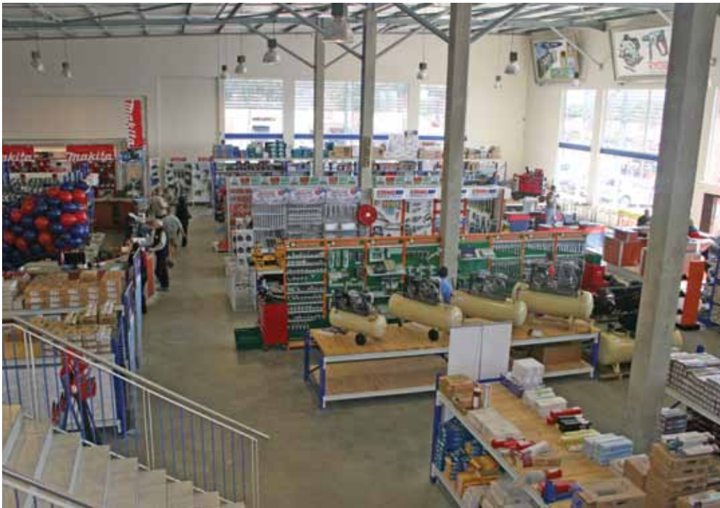
A view of the inside of the store which caters for both the DIY, the industrial and the welding markets. Brands include: Lincoln Electric, Jonnesway, Gedore, Ingersoll Rand, Harris, Abicor Binzel, Jonsson Workwear, Air Products, Tork Craft, Pferd, Uvex and Makita.

range of local and international expertise is also available should we need it."