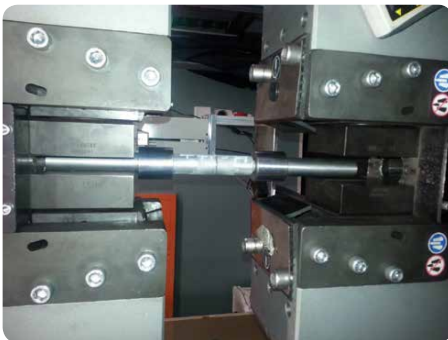
Adhesion tests in accordance with EN 582/ASTM C633 (above), along with the micro indentation tests are critical in defining coating quality.

To obtain a complete picture of the adhesion of thermal spray coatings, the influence of the base material, as well as