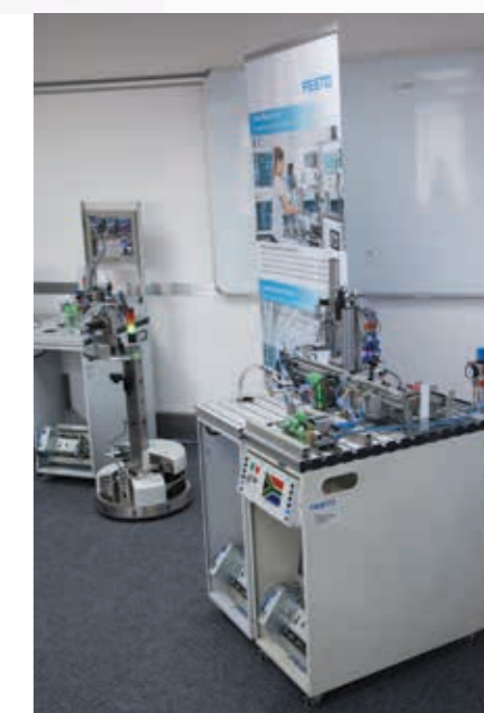
On display at the seminar is a Festo Didactic system demonstrating the flexible manufacturing opportunities already on offer.

"But there are no standards, and it is therefore expensive. Industry 4.0 aims to revolutionise the communication aspects of monitoring systems. As soon as one adopts