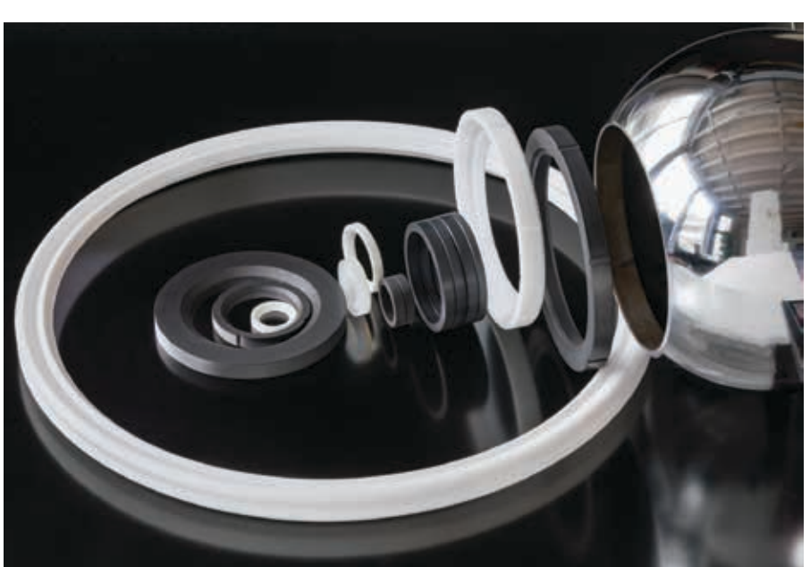
Ball valve seats and packings in various materials for different applications.

Describing its properties, Botha says that PTFE is a thermoplastic, but due to its high viscosity, it cannot be processed using conventional polymer processing techniques. "PTFE has to be first processed cold during shaping/ pressing operations, followed by hot sintering to fuse the particles. It can also be welded, though, should a particularly large billet or component be needed.