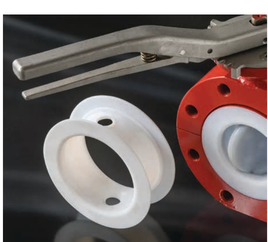
PTFE liners for Butterfly valves.