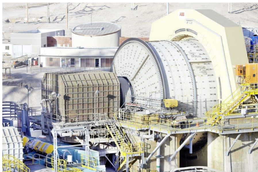
ABB Ability™ MineOptimize digital solutions can help to streamline every stage of the mining value chain.