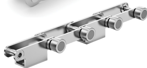
A Kobo reclaimer chain. Bi supplies a complete range of engineered chains for conveying and reclaiming equipment.

alignment as well as chain wear and elongation reports.