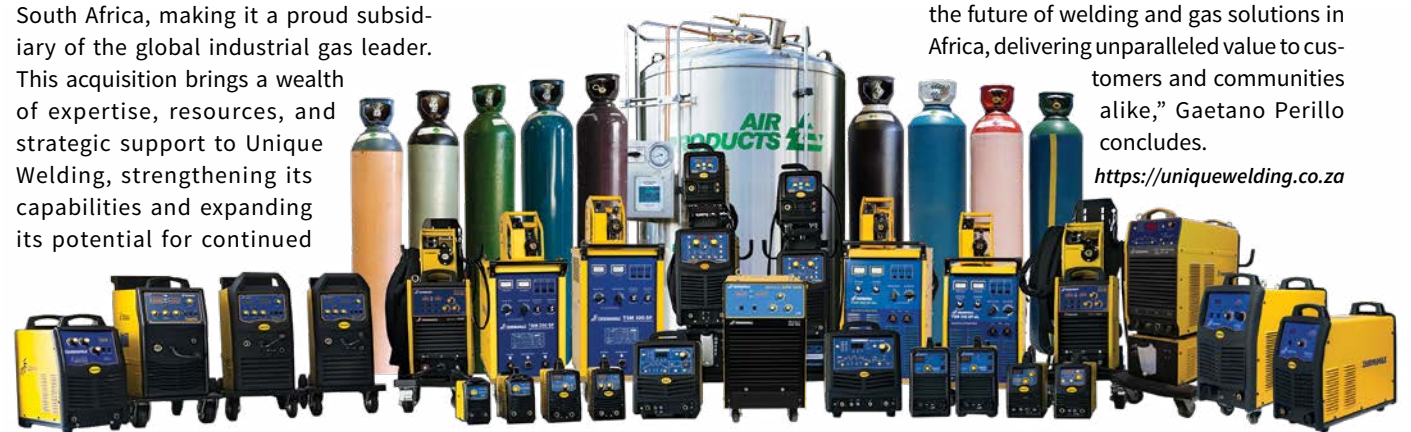
The flagship Thermamax equipment range from Unique Welding.