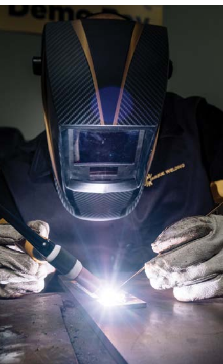
At its core, Unique Welding is a fully integrated solutions provider.